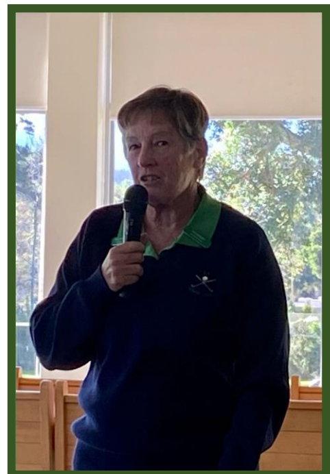
Our dear President over-seeing her second last Prize-Giving!!